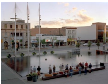
Scott Conarroe, Parochial Views No. 4: Model Boat Club , Pool at Kitchener City Hall, 2006, photograph. Gallery purchase with the assistance of the City of Kitchener, the City of Waterloo, the Musagetes Fund at The Kitchener and Waterloo Community Foundation, and the Acquisition Assistance program of the Canada Council for the Arts, 2007.