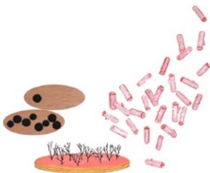
Adriana Kuiper, selection from the Help series, 22" x 32", mixed media.