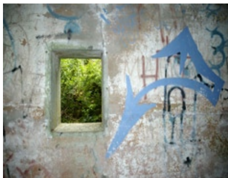
Cora Cluett, In The Offing No.7 , 2008, C-print, 24" x 36".

101 Queen Street North Kitchener, ON N2H 6P7 www.kwag.on.ca