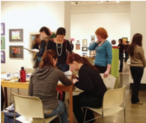
Friday Night @ KW|AG participants get creative with their art-making, April 2007.

101 Queen Street North Kitchener, ON N2H 6P7 www.kwag.on.ca