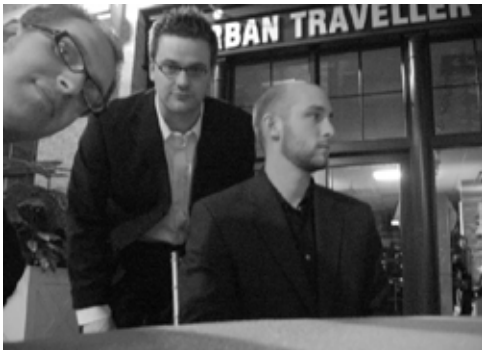
Musicians No Radio will perform at Friday Night @ KW|AG on February 20th.