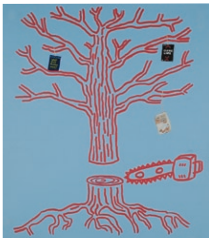
Cynthia Girard, Our Origins , 2001, acrylic on canvas, 173 x 152.5 cm.

101 Queen Street North Kitchener, ON N2H 6P7 www.kwag.on.ca