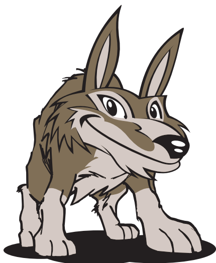
Peter and the Wolf. Image courtesy of KWS.