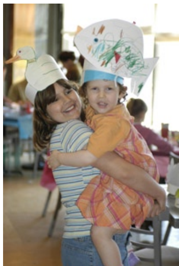
Youngsters enjoy creating art and spending time together at KW|AG's art workshops.