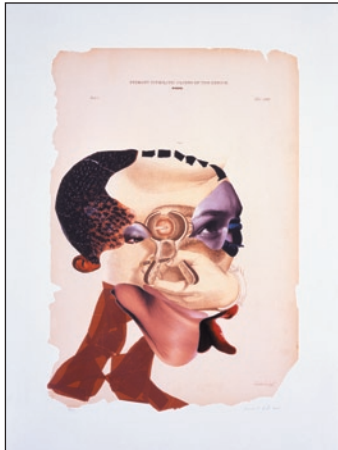
Wangechi Mutu, Histology of the Different Classes of Uterine Tumors , 2006, digital prints and mixed media collage. Image courtesy the artist and Sikkema Jenkins & Co., New York.