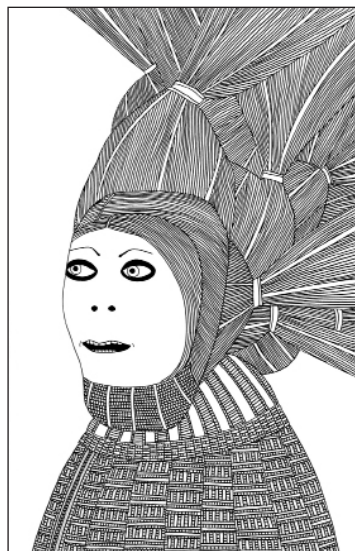
Laylah Ali, Untitled , 2006-7, ink and pencil on paper.