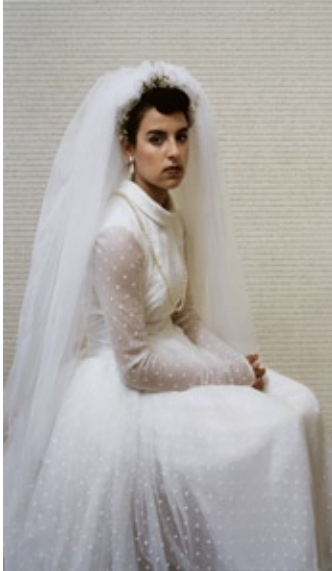
Shirin Neshat, Pari , 2008, C-print and ink, 182.9 x 125.7 cm, Edition of 5 + 2 APs, Copyright Shirin Neshat. Image courtesy of Gladstone Gallery, New York.

101 Queen Street North Kitchener, ON N2H 6P7 www.kwag.on.ca