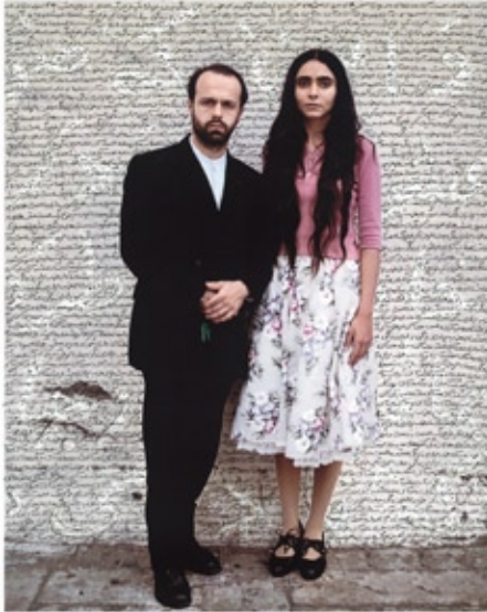
Shirin Neshat, Faezeh & Amir Kahn , 2008, C-print & ink, 223.5 x 177.8 cm), Edition of 5 + 2 AP, Copyright Shirin Neshat.

101 Queen Street North Kitchener, ON N2H 6P7 www.kwag.on.ca