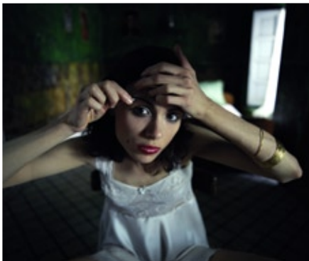
Shirin Neshat, Untitled (Zarin Series) , 2005, C-print 120.7 x 152.4 cm, Edition of 5 + 2 AP, Copyright Shirin Neshat. Image courtesy of Gladstone Gallery, New York.