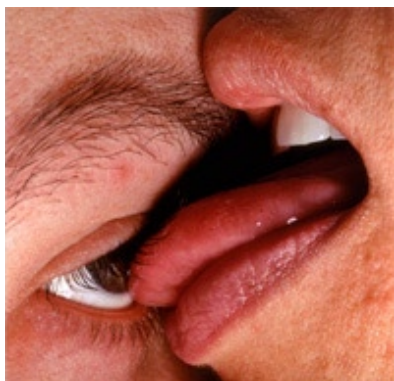
Janine Antoni, Mortar and Pestle , 1999. C-print, 48 X 48 inches. Courtesy of the artist and Luhring Augustine, New York.

101 Queen Street North Kitchener, ON N2H 6P7 www.kwag.ca