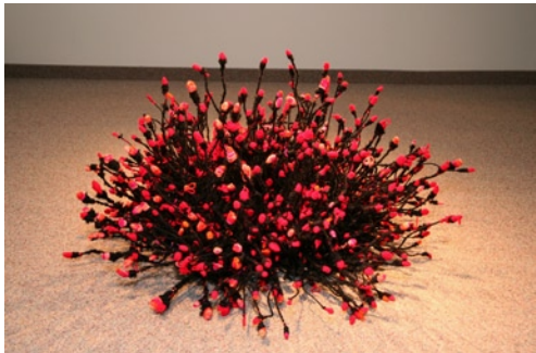
Ann Marie Hadcock, Para Red , 2009, wool and wire, five individual sculptures, approx. 30" – 72".

101 Queen Street North Kitchener, ON N2H 6P7 www.kwag.ca