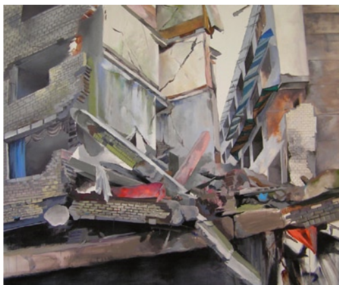
Ehryn Torrell, Twist (from street level) , 2009, acrylic on canvas, 68" x 58".

101 Queen Street North Kitchener, ON N2H 6P7 www.kwag.ca