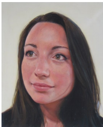
Eileen MacArthur, Madison , 2008, oil on board, 9" x 11".