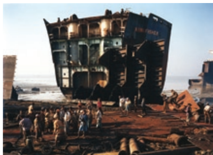
Edward Burtynsky (Canadian, b. 1955), Shipbreaking #4, Chittagong, Bangladesh, 1/5, 2000 , photograph, 100 x 125 cm, Kitchener-Waterloo Art Gallery, gift of the artist, 2000.

101 Queen Street North Kitchener, ON N2H 6P7 www.kwag.on.ca