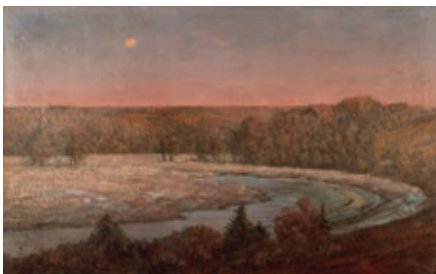
Homer Watson (Canadian, 1855 – 1936), Ice Break on the Grand River , 1924, oil on canvas laid on masonite, 109 x 145 cm. Kitchener-Waterloo Art Gallery, gift of Earl Putnam, 1980.