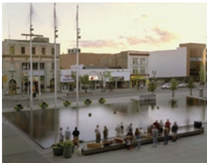
Scott Conarroe (Canadian, b. 1974), Parochial Views No. 4: Model Boat Club, Pool at Kitchener City Hall , 2006, photograph, 75 x 98 cm. Kitchener-Waterloo Art Gallery, purchased with the support of the City of Kitchener, the City of Waterloo, the Musagetes Fund at the Kitchener and Waterloo Community Foundation and the Canada Council for the Arts, 2007.