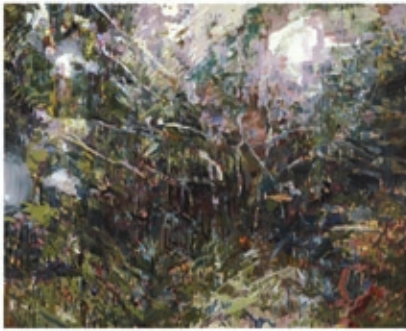
Monica Tap (Canadian, b. 1962), Road to Lily Dale I , 2006, oil on canvas, 203 x 251 cm. Kitchener-Waterloo Art Gallery, gift of the artist, 2008.

101 Queen Street North Kitchener, ON N2H 6P7 www.kwag.on.ca